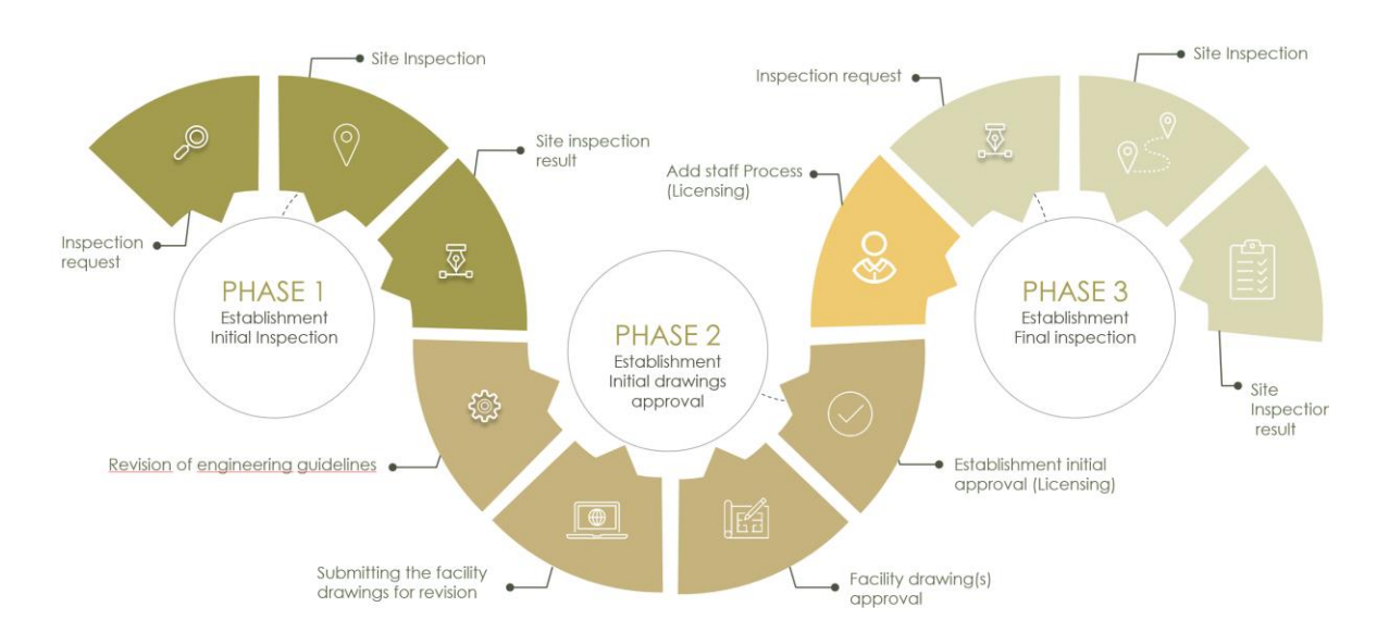
Figure 1 Procedure of issuing healthcare facility building approval from the engineering section