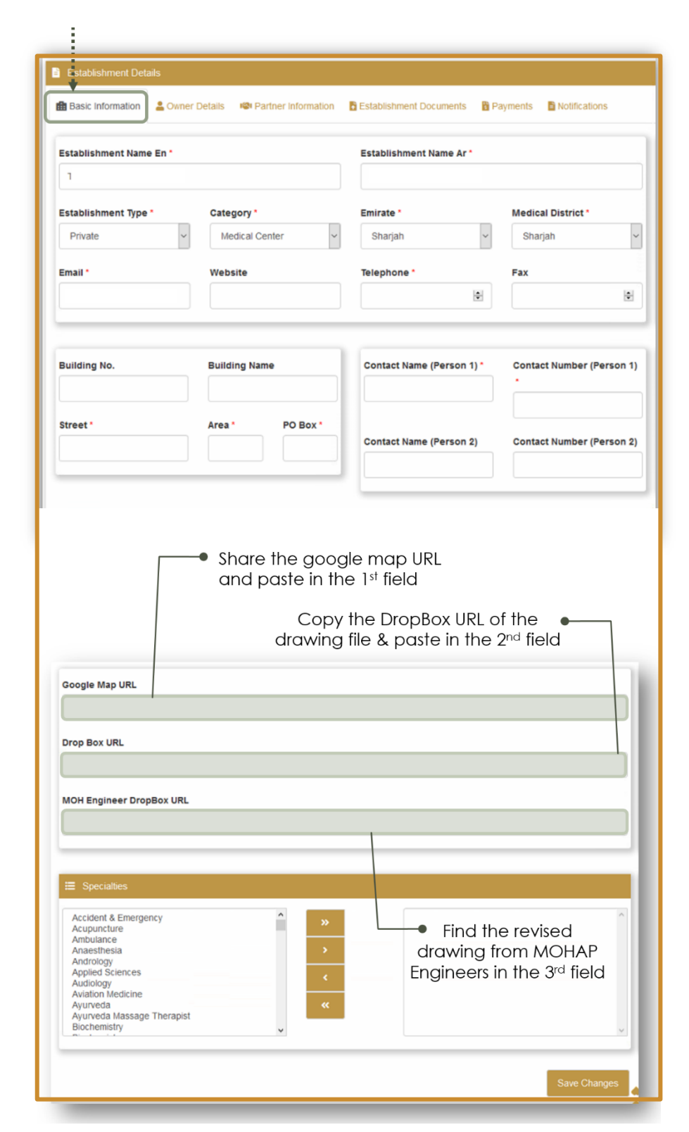
Figure 3 Establishment details - Basic information